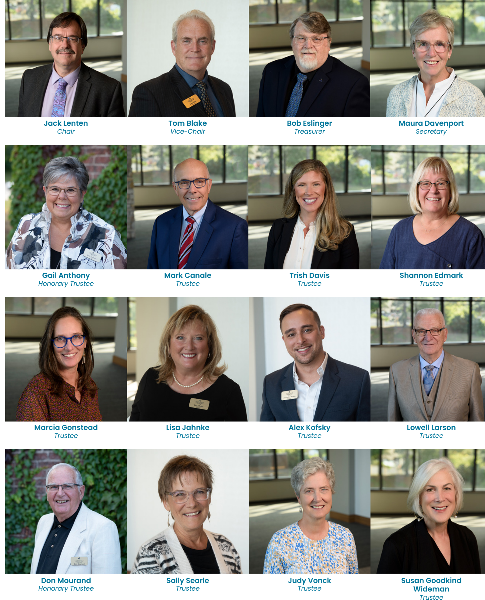
Jack Lenten Chair