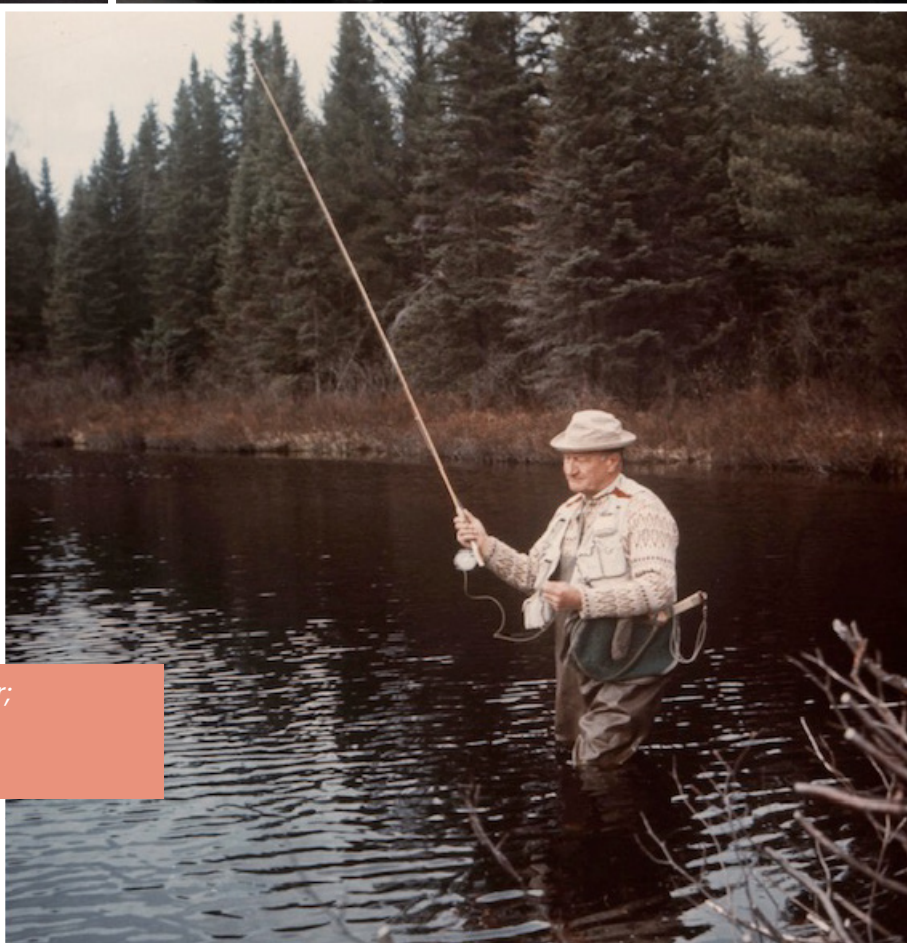
John D. Voelker: Attorney and Prosecutor; Michigan Supreme Court Justice; Novelist; Fly Fisherman.