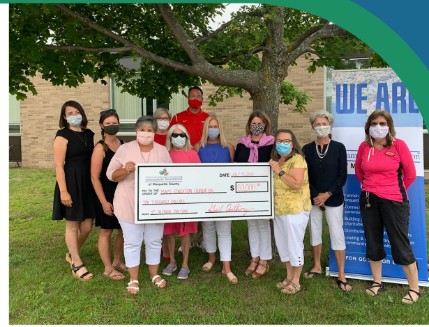
Representatives from the Community Foundation present a check to representatives from the Education Foundation for Marquette Area Public Schools to support the 1st to Finish CSA Fund.