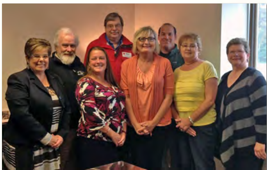
2014 Romney Grant Recipients

The George W. Romney Volunteerism Endowment Fund is a partnership between the Community Foundation of Marquette County and the United Way of Marquette County. Funds are available to registered 501(c)3 non profit organizations who recruit, train, manage or otherwise increase volunteerism.